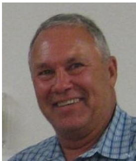
Gold Country Woodcrafters