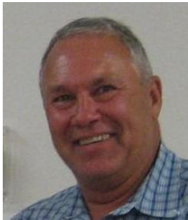
Gold Country Woodcrafters