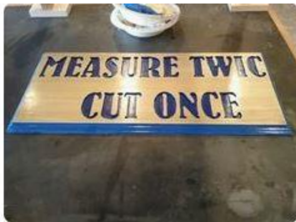
Measure twice cut once