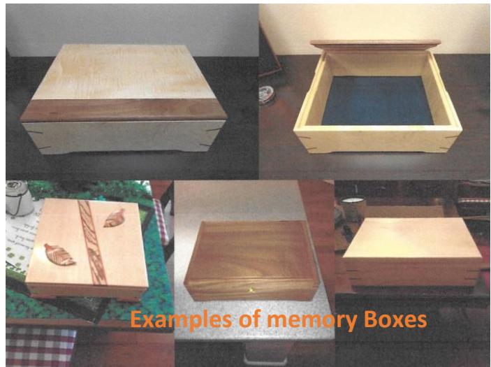
Examples of memory Boxes